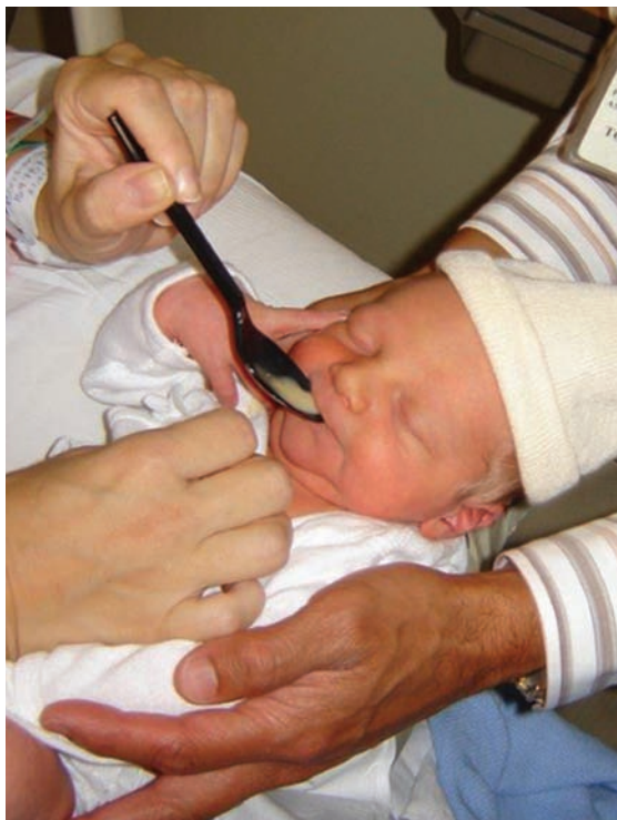
FIGURE 1 A Care Provider Assists a Mother With Spoon-Feeding to Satiety