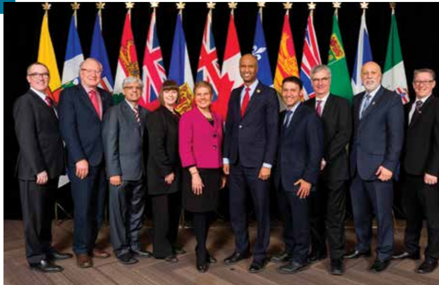
Forum on Francophone Immigration– Group photo of ministers responsible for Immigration and for Francophone Affairs – March 2, 2018, Toronto, Ontario

The Senate Standing Committee on Official Languages was in Winnipeg on February 15, 2017 to hear from Manitoba's Francophone community on potential changes to The Official Languages Act. The minister responsible for Francophone Affairs, the Clerk of Executive Council and the executive director of the Francophone Affairs Secretariat presented.