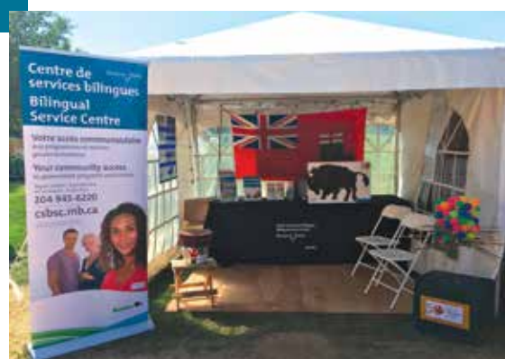
The Bilingual Service centre Kiosk at the Forks on Manitoba Day during the 2017 Canada Summer Games.