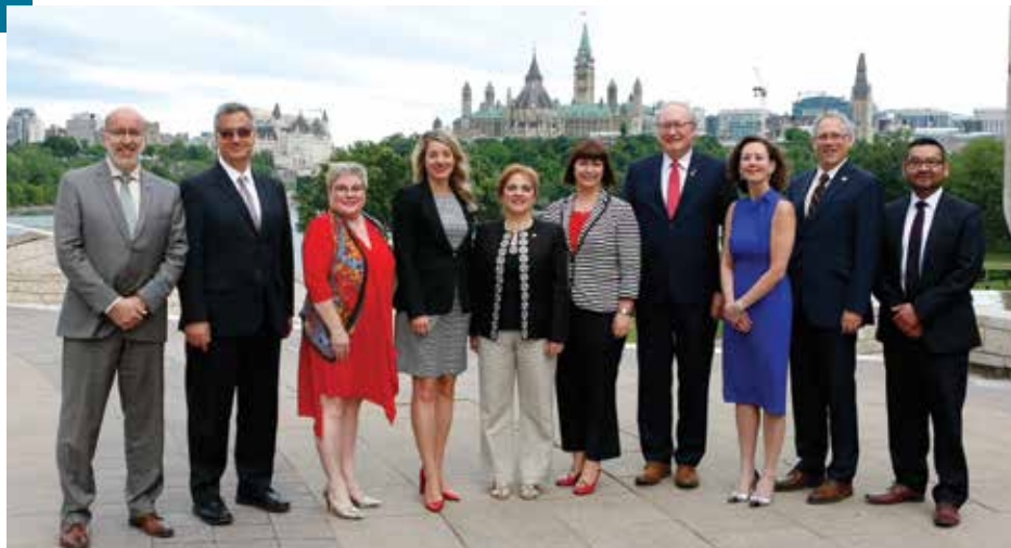
Ministerial Conference on the Canadian Francophonie– June 22-23, 2017, Canada's National Capital Region

The executive director attended the 22 nd Ministerial Conference on the Canadian Francophonie (MCCF) on June 22 and 23, 2017 on behalf of the Honourable Rochelle Squires, minister responsible for Francophone Affairs. The MCCF, created in 1994, is the only intergovernmental forum that brings together the ministers responsible for the Canadian Francophonie. The 150 th Anniversary of Confederation was the theme for the meeting, which was held in Canada's national capital region.