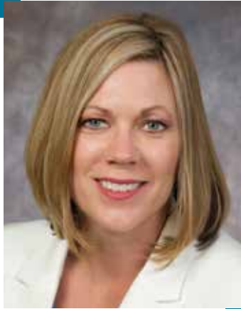
Honourable Rochelle Squires Minister responsible for Francophone Affairs