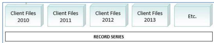
Illustration 2 shows how, over time, records that document an activity, or sub-activity, form a records series.

The context of creation is key to understanding a records series and what types of information are contained in the records. For example, many areas create client files. However the context of creation (the functions and activities of an organization) greatly affect our understanding of the records. See the two examples below. Both are considered client files by the program areas, and both may even seem to have some of the same information in the files.