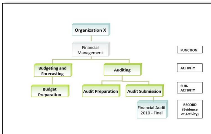
Illustration 1 – an example of the financial management function having multiple activities and each of the activities having sub-activities.

Activities may consist of further sub-activities or processes: e.g. 'auditing' activity might have sub-activities that include 'audit preparation' and 'audit submission'.