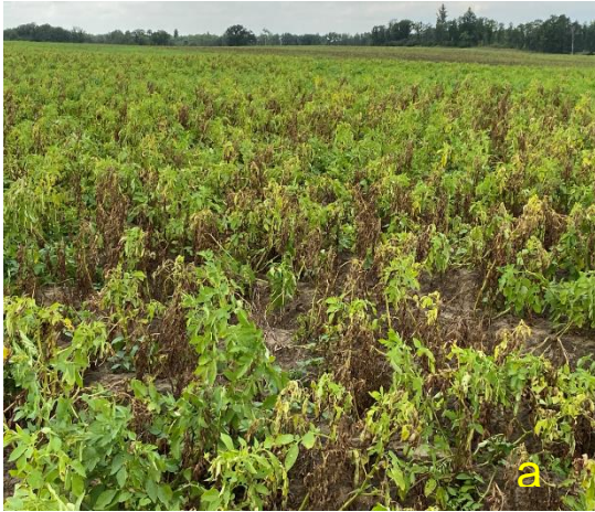
Fig.4a, b, c. Early dying due to Verticillium wilt (a) and also black dot (b). c: Early dying with Verticillium and black dot.