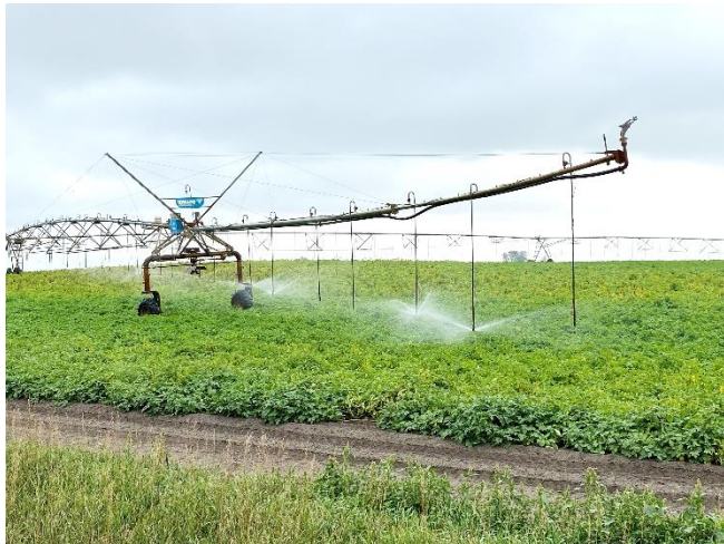
Fig. 3. Irrigation is still ongoing to meet the crop water demand. Last week had very scant rains across Manitoba.