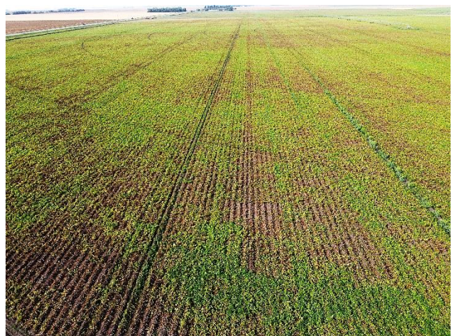
Fig.5. There are significant differences between fields, in early dying due to Verticillium wilt and black dot. (a) Field with very low incidence of early dying compared to (b) very high levels Photos: Vikram Bisht, Manitoba Agriculture).