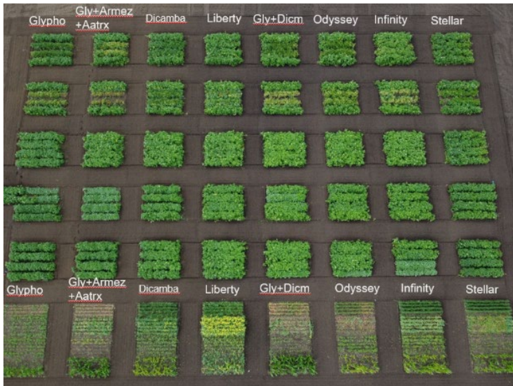
Fig.3. Field map of the demonstration plot for herbicide injury – rows at the bottom are wheat, canola, soybean and corn.