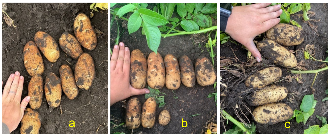
Fig.4. Tubers are bulking well. a, b: Rangers and c: Dakota Russet.