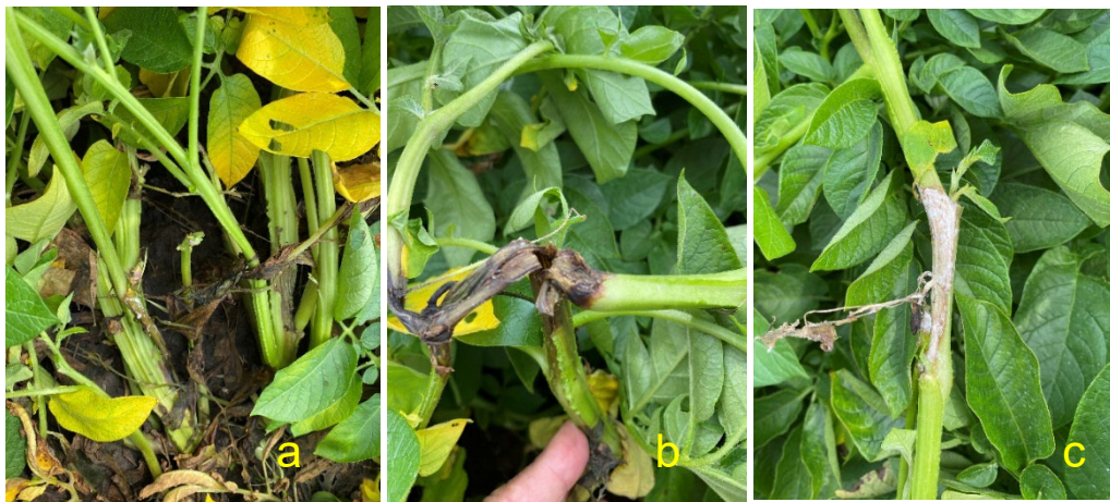
Fig. 5. Rots in the under-canopy of plants settled on ground due to high moisture a: Botrytis b: bacterial rots and c: white mold.

ALH = Aster leafhopper, PLH = Potato leafhopper.