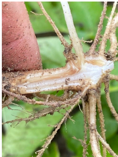
Fig. 6. Verticillium root and stem browning causing early dying.