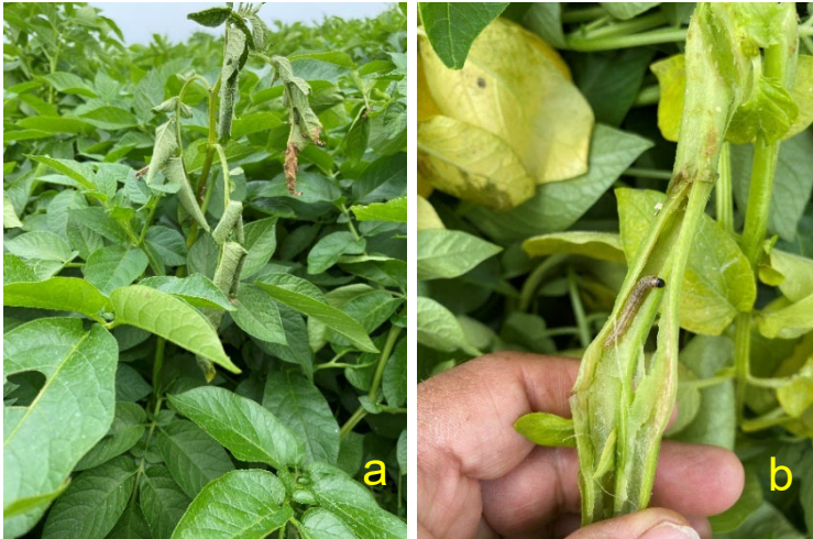
Fig. 7. European Corn borer on potato stem: a, Wilting top indication of borer hole damage (Vikram Bisht, MB Ag); b: ECB larva inside potato stem (Amy Unger, MHPEC)

European Corn Borer monitoring has been going on since June 26. European corn borer damage to potato stems continues to be reported from western Manitoba (Fig. 7), but the incidences appear to be minor and the moths trapped in the Delta pheromone cards have drastically reduced ( Table 3 ). This should be the end of ECB monitoring using Delta traps for the season. Western Manitoba has high trap counts as in previous years; Melbourne had the highest trap counts (2 years in a row).