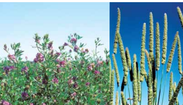
Alfalfa ( Medicago sativa L.)

Alfalfa ( Medicago sativa L.) is distributed worldwide. Often called the Queen of Forages, alfalfa is a herbaceous perennial legume. Manitoba alfalfa is of the finest quality and is known for its excellent milking abilities.